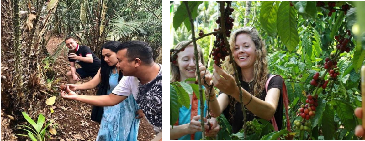
Figure 2: Potential of salak and coffee plantations in the village of Munduk Temu Bali