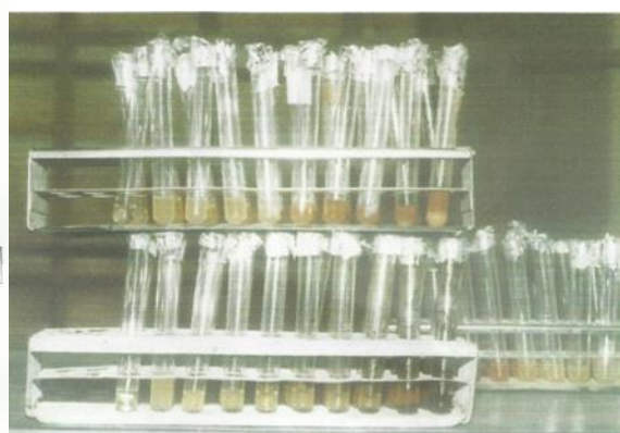
Figure 2: MIC Determination

The results of the elemental analysis, phytochemical screening, antimicrobial tests and minimum inhibitory concentrations for the water and ethanolic extracts are presented in Tables 1 to 6.