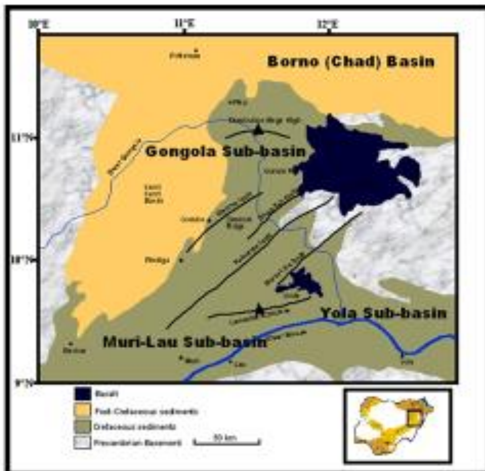
Figure 1: Geological map of Northern Benue Trough (modified from Zaborski et al, 1997).

The Benue Trough of Nigeria is a rift basin in the Central West Africa that extends NNE-SSW for about 1000 km in length and 50-150 km in width [4, 5]. The southern limit is the northern boundary of the Niger Delta, while the northern limit is at the Dubulawa-Bage High, which marks the southern boundary of the Chad Basin (Fig.1) [1]. The Benue Trough is geographically subdivided into Northern, Central and Southern Benue Trough (Fig.1). The Northern Benue Trough is made up of three arms: the N-S striking Gongola Arm, E-W striking Yola Arm and the NE-SW striking Muri-Lau Arm [4] (Fig.2). The Trough is over 6000m deep containing Cretaceous to Tertiary sediments of which those predating the mid-Santonian have been tectonically deformed, to form major faults and fold systems across the basin.