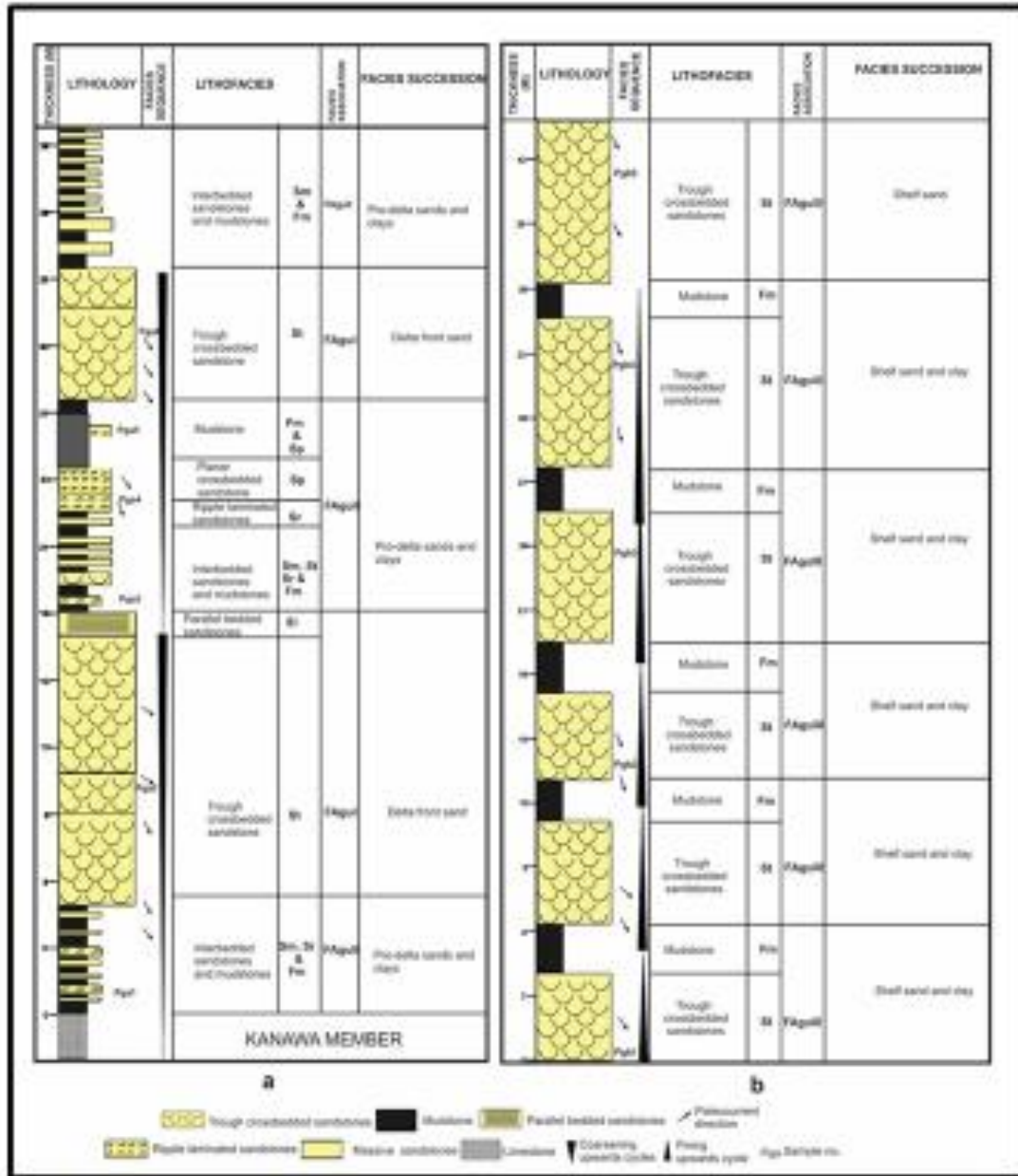
Figure 3: Lithologic section of the Gulani Member (a) Eastern part of Gulani town (b) Northern part of Gulani town.