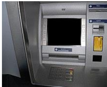
A Wincor Nixdorf ATM running Windows 2000

But let's focus our attention on the software where aspect of the ATM because that is what this research is all about. With the migration to commodity Personal Computer hardware, standard commercial "off-the-shelf" operating systems, and programming environments can be used inside of ATMs. Typical platforms previously used in ATM development include RMX or OS/2 .