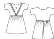
MRR 5 G 4