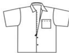
MRR 3 G 1