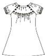
MRR 1 G 3