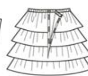
MRR 4 G 2