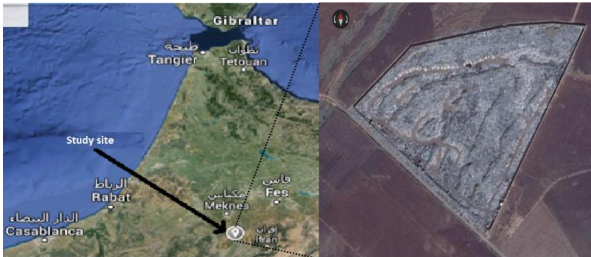
Photo 1: Satellite image of the location of the wild dump of El Hajeb city (Morocco)

The municipal dump, which serves this city, is located to the west and about 12 km from this town. Its geographical coordinates in degrees are: latitude 33°39'55.7 "North; Longitude 5°27'29.1 "West.