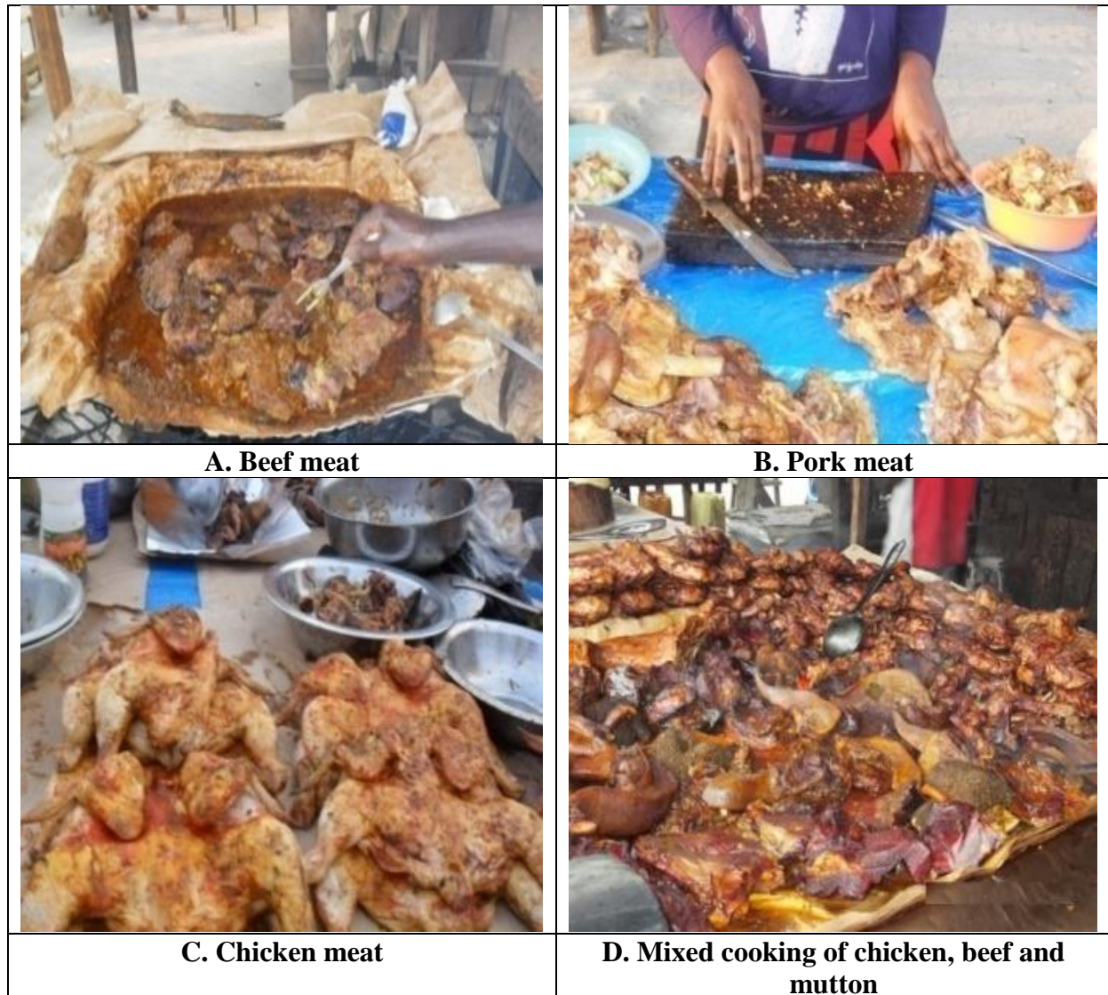
Figure 2: Picture showing the kind of meat collected