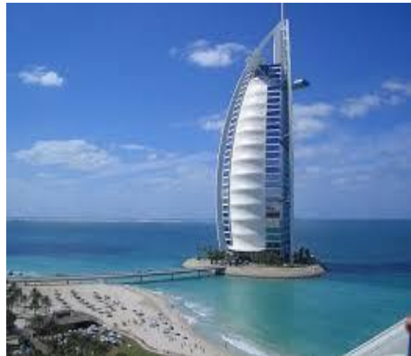
Figure 4: Burj Al Arab Jumeirah Hotel Dubai