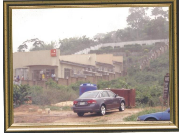
Figure 3: Guarantee Trust Bank (GTB) Along State Secretariat Road, Ado-Ekiti