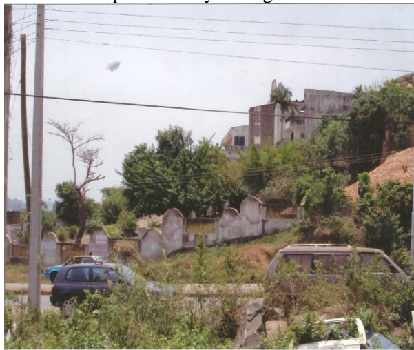
Figure 2: Otunba Reuben Famuyibo House Along Ilawe Road, Ado-Ekiti

Source: Adapted from https://www.google.com/search?q=frank+lloyd+wright&