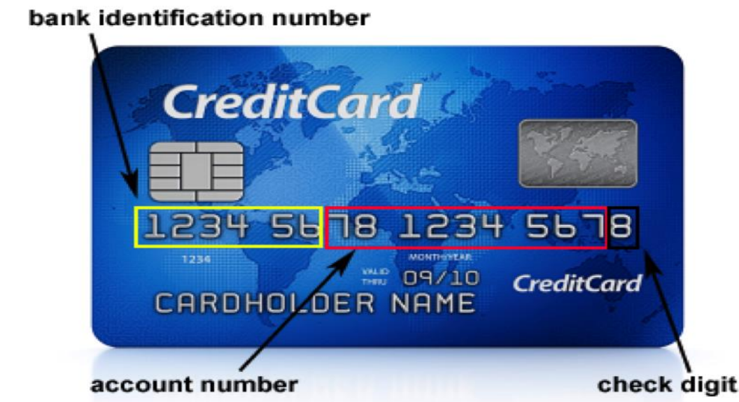
Figure 1: Front side of credit card 11

The below figure clearly explain the description about credit card.