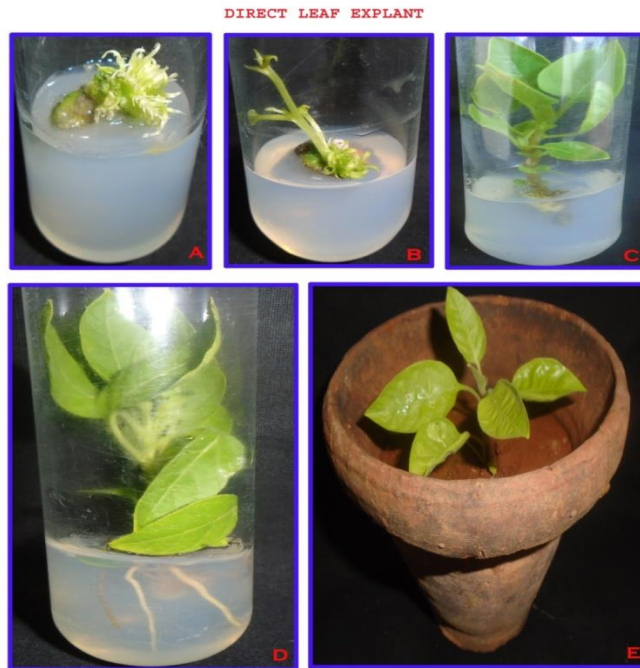
Figures 1: (PLATE-1)