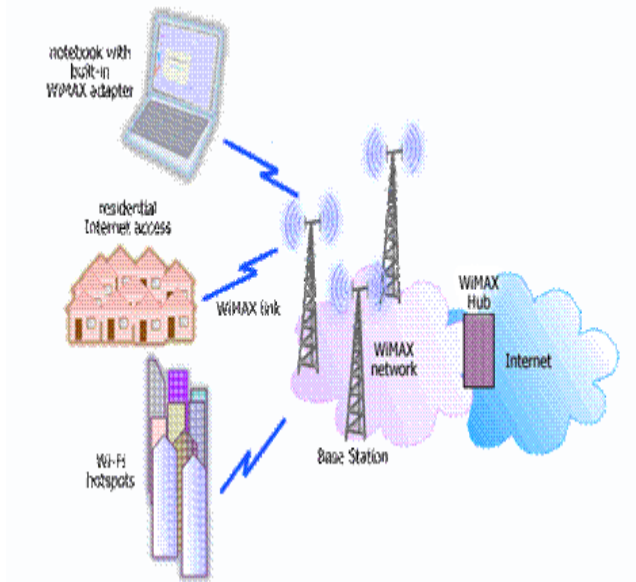
Figure 2: Wireless MAN