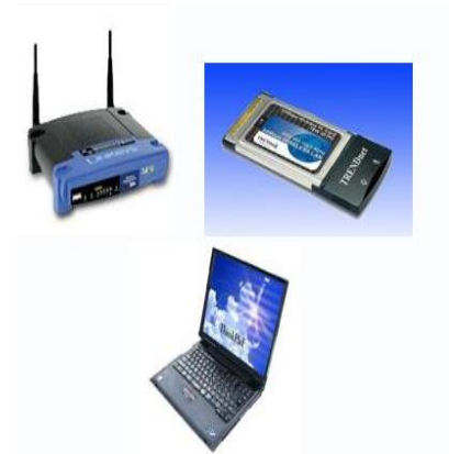
Figure 3: Wireless LAN